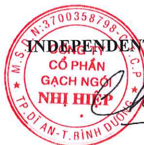
BUI HOAI CHAU